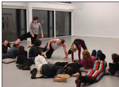
Mentored Choreographic Lab