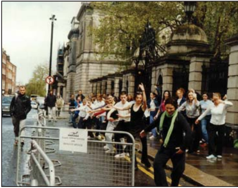
Dance on Dáil Éireann

print and broadcast media, organised meetings and letter writing. A significant number of Dance Ireland members made valuable contributions to the campaign, see www.ncfa.ie .