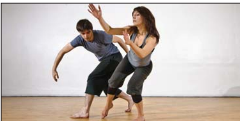
Maximum Exposure 2010