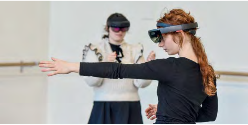
Light Moves Residency by Ewa Figaszewska