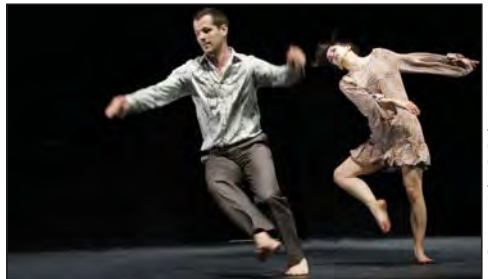
MSY2 [me seeing you too]