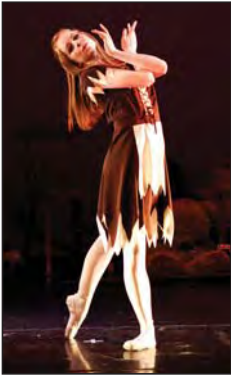
Youth Ballet West