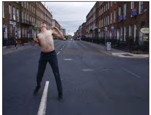
Daghdha Mentoring Programme

Inevitably the artists on the programme have been inspired by working and living in Limerick. With such a wide spectrum of artistic styles and mediums, Now promises a compelling programme, not to be missed. Some performances may contain adult material.