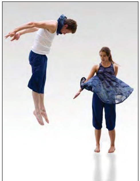
Dublin Youth Dance Company

DYDC are looking for committed and enthusiastic dancers, age 12 - 16 and ages 17 - 26, with experience in at least one dance form, such as contemporary, tap, ballet, hip-hop or some other movement training. DYDC presents an exceptional opportunity to work in a professional directed company, which offers training, choreographic opportunities, performances and tours nationally and internationally. For more information, please contact: 085 1585837 or email: info.dydc@gmail.com .