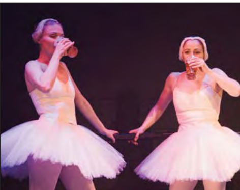
The Ballet Ruse