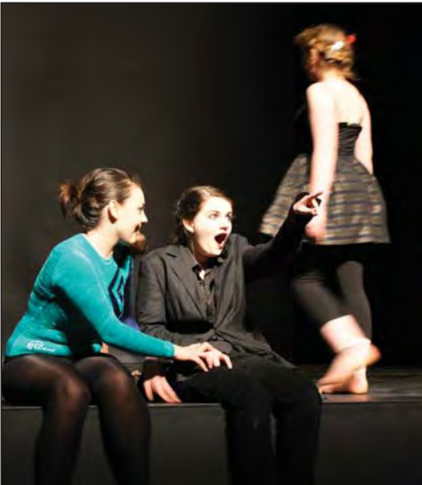
County Wexford Youth Dance Festival

County Wexford Youth Dance Company (CWYDC), with funding from Leargas, has undertaken a dance