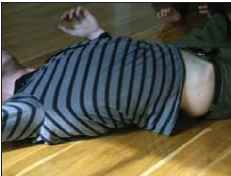
Standing in Ink

Commencing in the spring term; Capoeira is a subtle blend of dance, music and the martial arts. Capoeira has greatly influenced the world of modern dance and hip hop. This class is taught by Oficina de Capoeira.