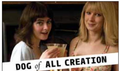
Dog of all Creation