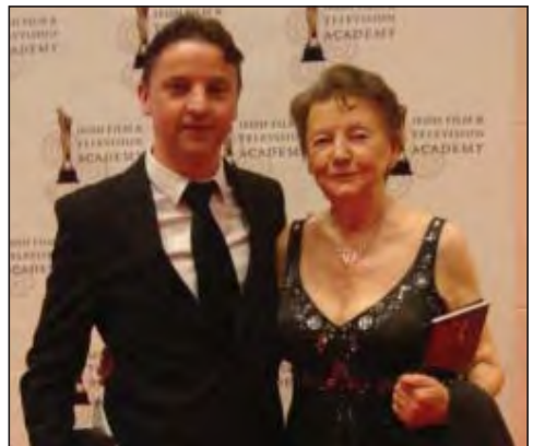
Deep End Dance @ IFTA

Back at home, our new Broadreach project, Silent Idols , is in full swing with drop-in classes in Santry, Ballymun, Donore Avenue, East Wall and Irishtown. Presented in partnership with Dublin City Council Arts, Sport & Leisure and Community Development Sections, these classes offer people aged 50+ the opportunity to learn and create dance sequences inspired by some of the madcap routines of the Marx Brothers, Buster Keaton and Charlie Chaplin.