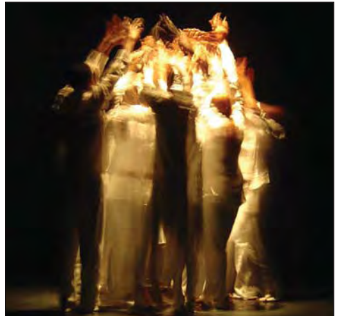
Fall & Recover