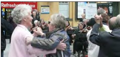
Macushla Dance Club

The Macushla Dance Club wishes to gratefully acknowledge Dublin City Council, Dance Ireland, Go for Life, Dormant Accounts Fund, Dublin Docklands Development Authority, the Arts Council and Impact, for making its activities in 2009/2010 and into 2011 possible.