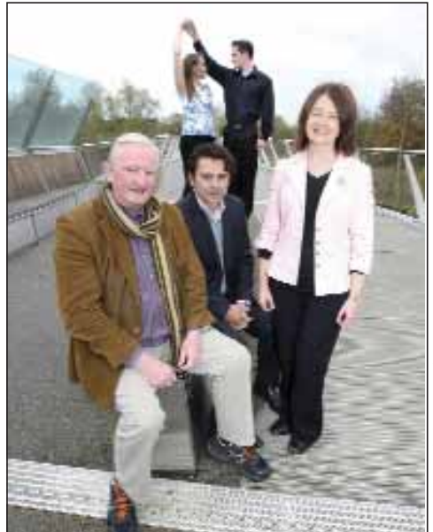
Dance Archive of Ireland Launch, Limerick