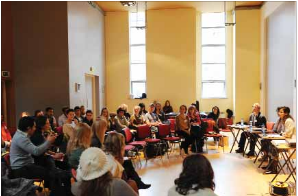
Limerick Forum, October 2009

Dance Ireland now accepts payment by credit and laser card.