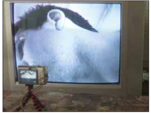
Travelling the Space Together

Culture Ireland has organised a showcase of Irish choreography in New York as part of APAP, a gathering of American presenters. At a time when Ireland's economic reputation is