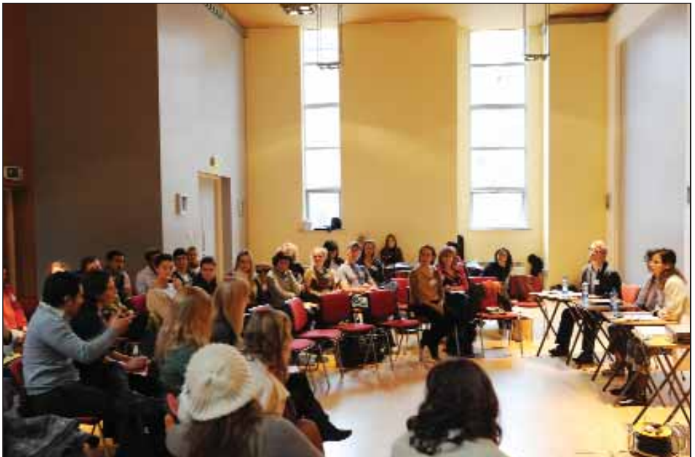
Limerick Forum, October 2009

Dance Ireland now accepts payment by credit and laser card.