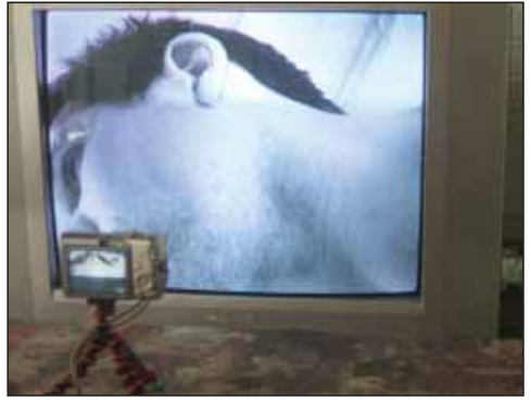
Travelling the Space Together

Culture Ireland has organised a showcase of Irish choreography in New York as part of APAP, a gathering of American presenters. At a time when Ireland's economic reputation is