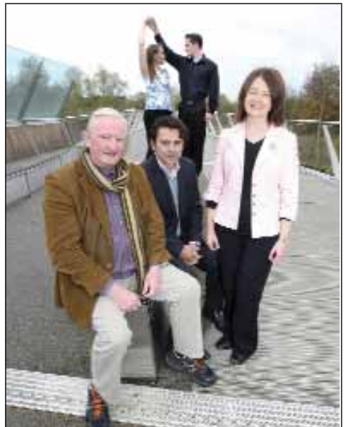
Dance Archive of Ireland Launch, Limerick