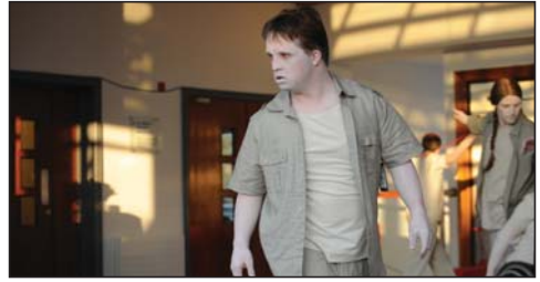
Movement for Life