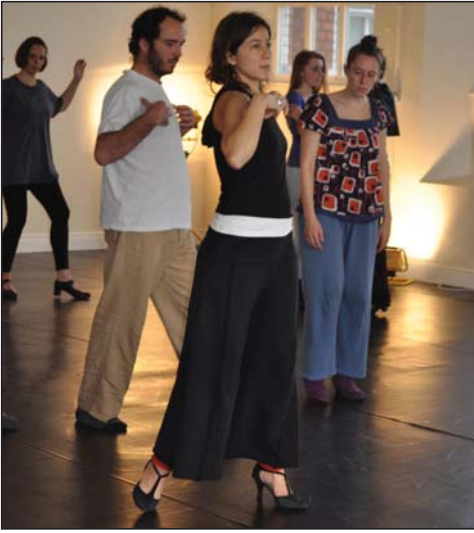
Echo Echo Dance Theatre Company

with other arts and crafts. His practice and exploration draws on a variety of movement-presence-performance techniques, vocal work, music & video, martial arts and the practice of meditation.