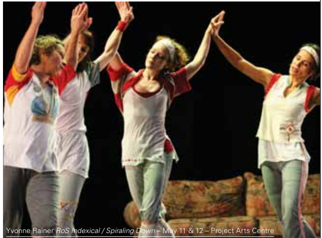
Yvonne Rainer RoS Indexical / Spiraling Down – May 11 & 12 – Project Arts Centre