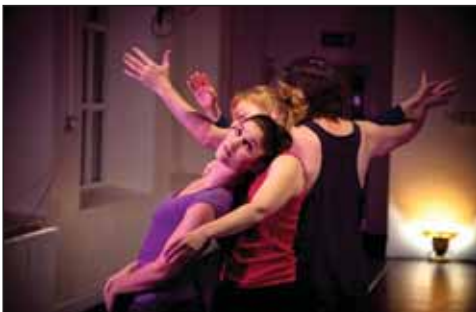
Echo Echo Dance Theatre Company

07 - 11 June, weekly pass for only €250 - this allows you to book up to 5 classes and Madam Silk performance 12 June. Also if you book into the week you can then have the 12 & 13 June for only €85. For full timetable of events, visit www.fidgetfeet.com .