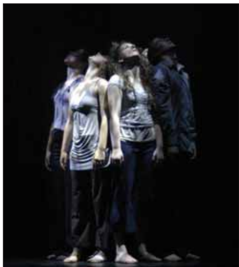
Kerry Youth Dance Theatre