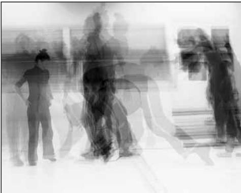
The Nations of Journeying