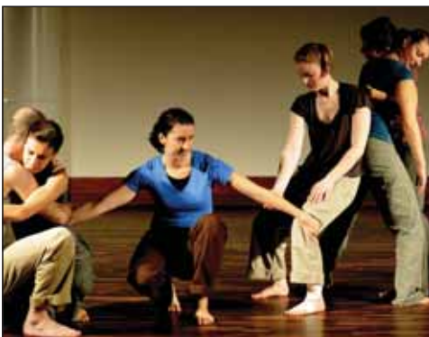
MA Contemporary Dance